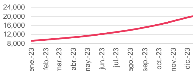
Annualized Effective Rate