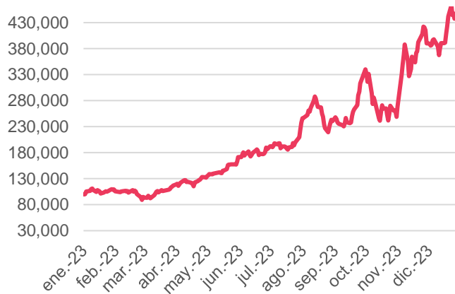
Direct Return on Investment